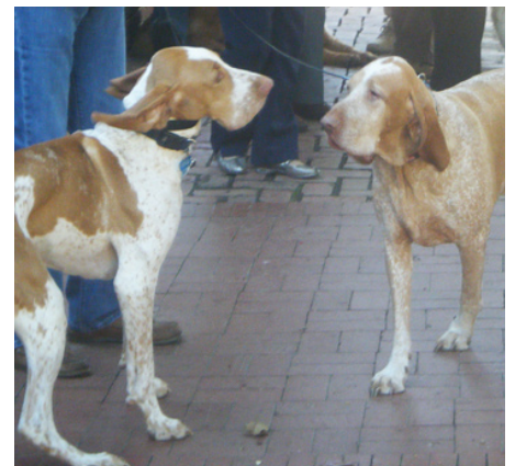
Pets often make new friends at the Blessing of the Pets.

As in previous years, there will be special prayers for beloved pets who have died and their retired collars, leashes, and photos may be brought for blessing.