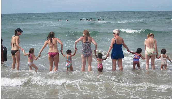
The mission team arranged for a day at a private beach for the girls

The primary purpose of our mission trip is to be with the girls. That may seem obvious and simplistic, until you think of our visit from the girls' perspective. They share their bedrooms with their sisters grouped by age and headed by caregivers, known as tias (Spanish for aunt). The tias hold the